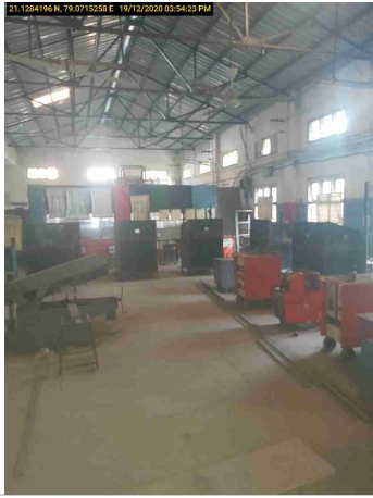
48 Training and Placement Cell Photograph