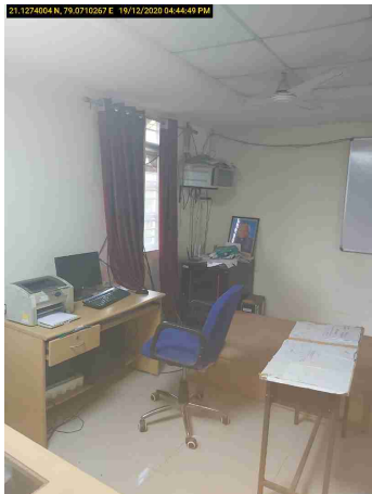
Image Geo Tag