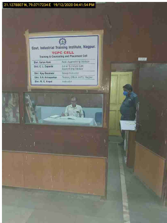
Image Geo Tag