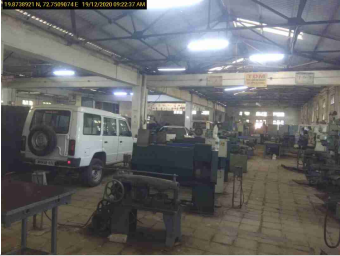
47 Revenue Generation Center Photograph