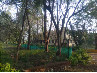
46 Hostel Photograph