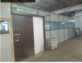
45 IT Lab Photograph