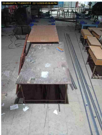
Image Geo Tag