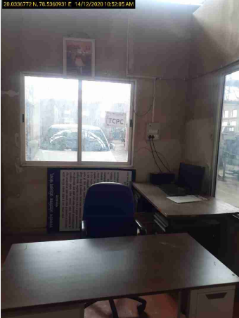
48 Training and Placement Cell Photograph