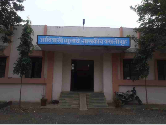
46 Hostel Photograph