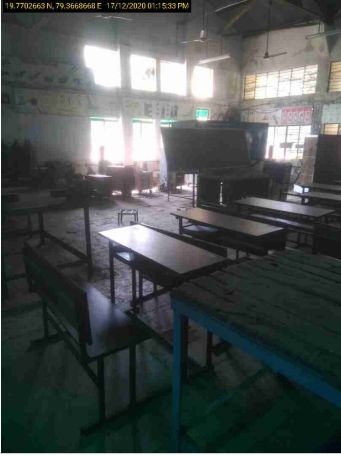
48 Training and Placement Cell Photograph