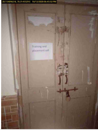
Image Geo Tag