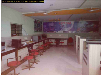
Image Geo Tag