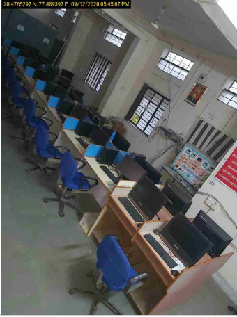
46 Hostel Photograph