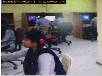
Image Geo Tag