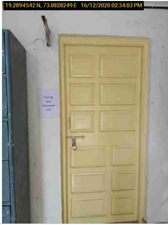
Image Geo Tag