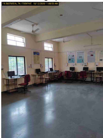
Image Geo Tag