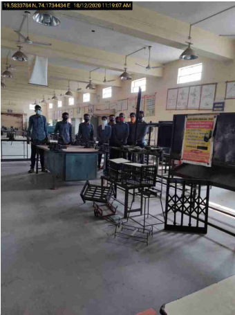
48 Training and Placement Cell Photograph