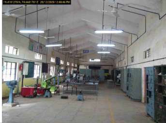
Image Geo Tag