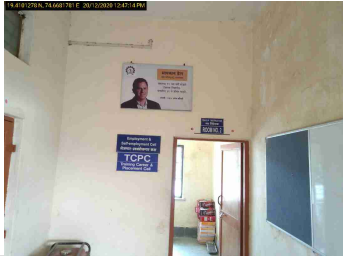
Image Geo Tag