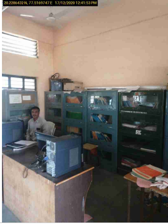
Image Geo Tag