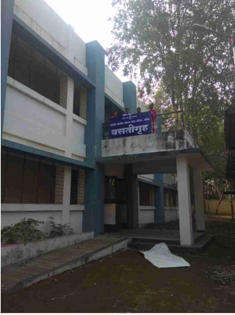
47 Revenue Generation Center Photograph